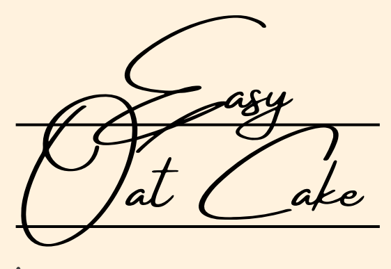
₩ III 12 servings